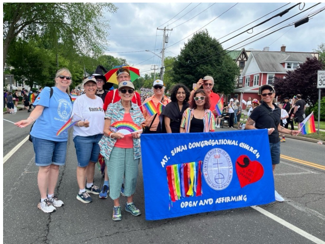
Participants from Mt. Sinai Church at the 2024 Pride Parade.

...We hope you'll join us for our 30TH BIRTHDAY AS AN OPEN AND AFFIRMING CONGREGATION at the Huntington Pride Parade, June 8th