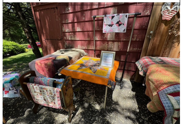
Older quilts were on sale at the Red Barn

Three lucky people won these beautiful quilts made by church members. Quilt raffles are always a big part of our shows.