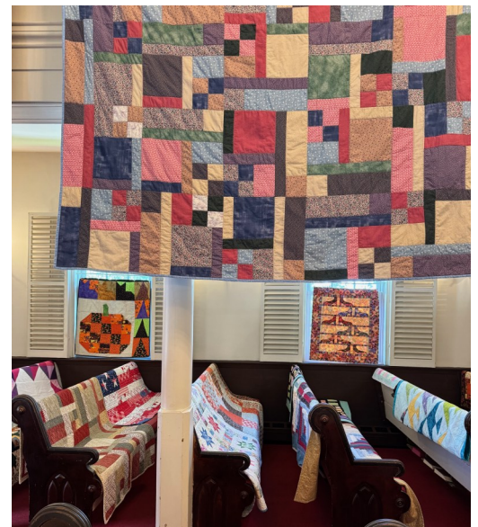
Beautiful and clever quilts of all kinds were on display.

Thank you to everyone who brought in quilts and worked to make this annual event a success for our church. A total of $1625 was raised between the Red Barn sales and quilt show raffles!